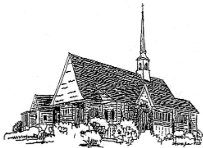
All Saints' Church, Rehoboth Beach

Sharing in the resurrection of Christ, walking in newness of life.