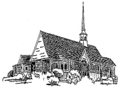
All Saints' Church, Rehoboth Beach

net to the other side and then invited them to breakfast on the beach. He also instructs Simon Peter, and us, to "Feed my sheep." Mark's Gospel ends more abruptly with the empty tomb and an angelic messenger, with an appendix describing several appearances and the Ascension of Jesus into heaven.