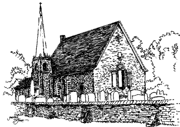
St. George's Chapel, Harbeson

concluded that human beings' deepest need is for meaning, and that those people who could find meaning even in the midst of the horrors could thus find a reason to continue living, and even with dignity. He quoted the philosopher Nietzsche's words,