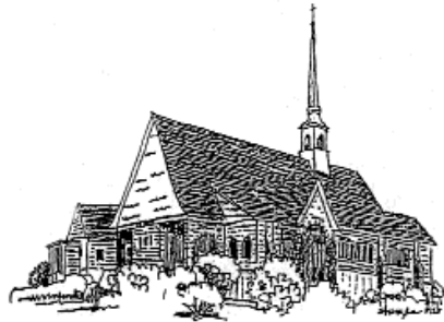
All Saints' Church, Rehoboth Beach

Frankl described his horrific experiences in a Nazi concentration camp. He recounted various stages of the camp inmates' responses to their torturous conditions which naturally included shock, bitterness and disillusionment. He