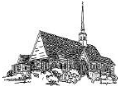
All Saints' Church, Rehoboth Beach

A former parishioner and dear friend called recently after hearing about the parish's most recent losses. He called with words of encouragement and then he